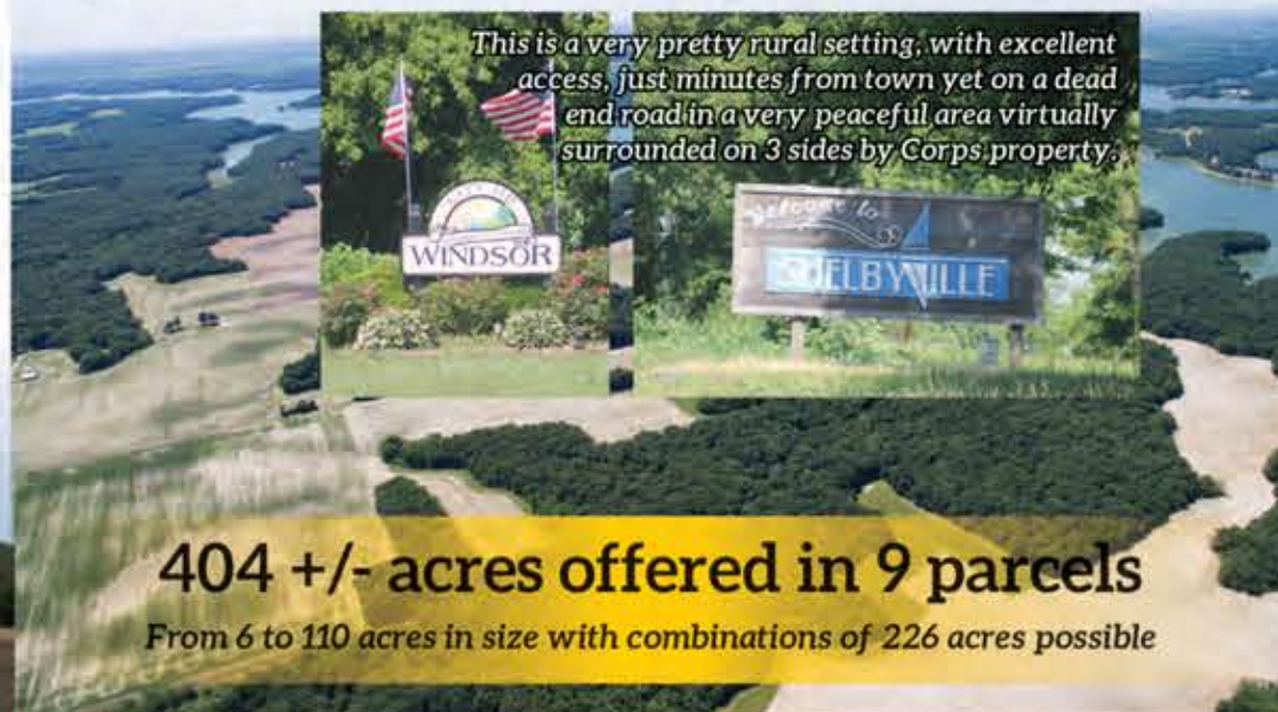
This is a very pretty rural setting, with excellent access, just minutes from town yet on a dead end road in a very peaceful area virtually surrounded on 3 sides by Corps property.