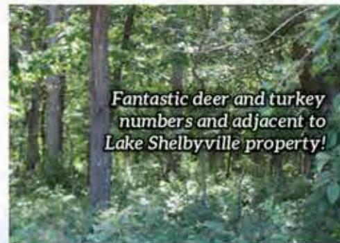
Fantastic deer and turkey numbers and adjacent to Lake Shelbyville property!