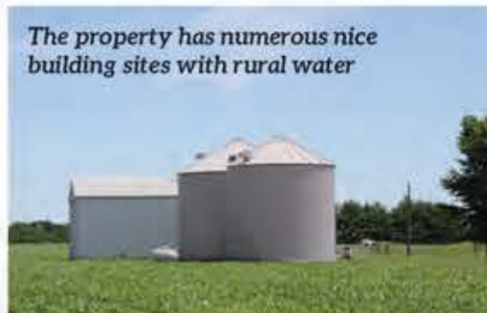
The property has numerous nice building sites with rural water

Directions: From Windsor take Rt.16 west to the 2300 East Road (Middlesworth Rd), travel north 2 miles then turn right (east) on 1500N for 1 mile then turn left (north) onto 2400 East and travel 1/2 a mile and the property is on both sides of the road. From Shelbyville take Rt.16 east to the 2300 East Road (Middlesworth Rd), travel north 2 miles then turn right (east) on 1500N for 1 mile then turn left (north) onto 2400 East and travel 1/2 a mile and the property is on both sides of the road.